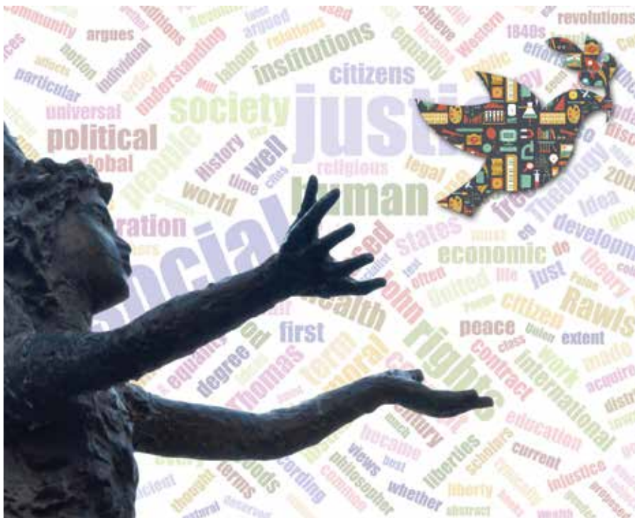
Fig. 3. The dove with an olive branch, a symbol of peace. Made from icons representative of science, flies against a word-cloud created from all the words in the Wikipedia page on “Social Justice.” Credits: Photograph and Illustration by Punya Mishra, 2016. License: CC-BY-NC.

How to implement: Each component of this model is important, but teachers must use all three to support social justice actions with science knowledge.