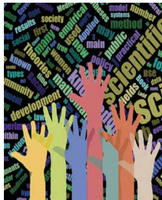
Fig. 2. Participatory engagement in a classroom context.

What can we learn from this study about the successes and failures of implementing ideas of social justice in science classrooms? Here are three components that appear to be important to enact in order to successfully teach science for social justice: