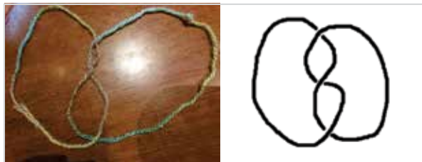
Figure 2. Trefoil

And now, with a little loosening of the wool :