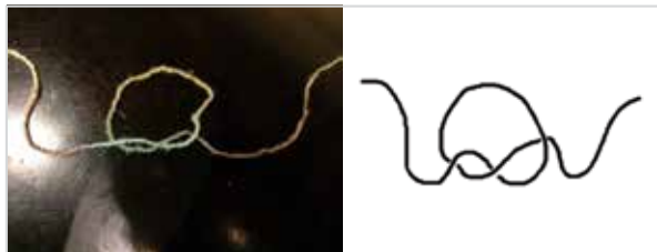
Figure 1. Trefoil (with Ramya's sketch alongside)

Here was the Trefoil in a familiar form: