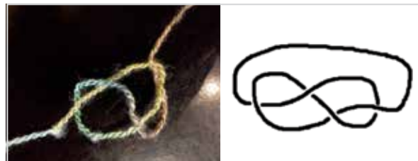
Figure 4. Cinquefoil

Look at the star shape with the 5 crossings: