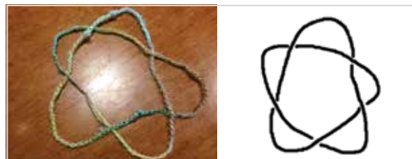
Figure 5. Cinquefoil

Look at the star shape with the 5 crossings: